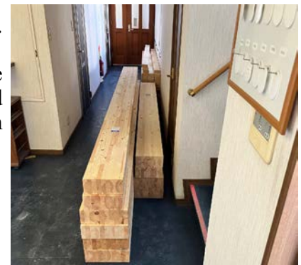
New Posts and Beams

Field Address 138-36 Noda Ooyasawa Aomori, Aomori 030-0123 JAPAN PH: 011-81 (17) 715-9091 Email: cantersjapan@gmail.com