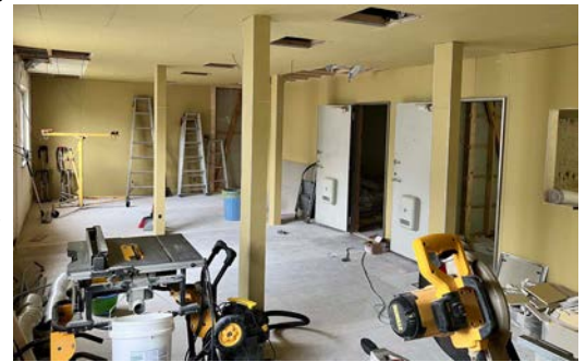
Working on temporary worship room